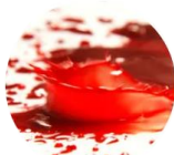
Bloodstain Pattern Analysis