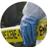
Crime Scene Review