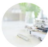
Forensic Case Review

Known for our fair-minded and rigorous approach, we have a reputation as trusted advisors in the realm of forensic science, ensuring our clients benefit from our unwavering commitment to precision and integrity.